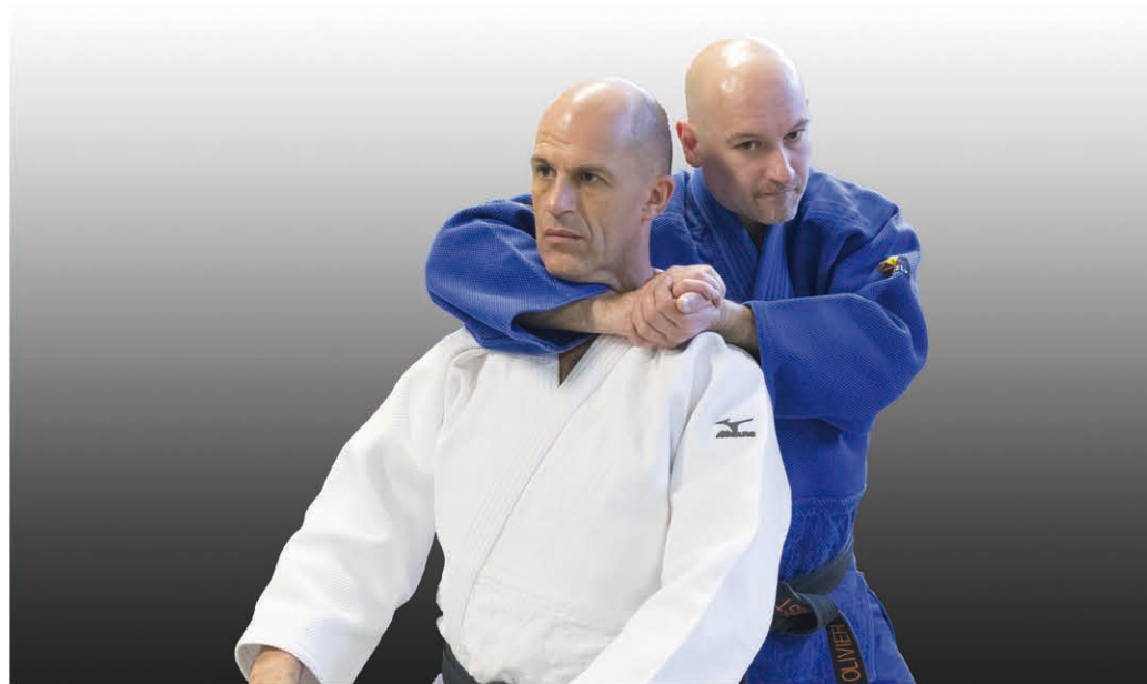
Strangulation with fore-arm