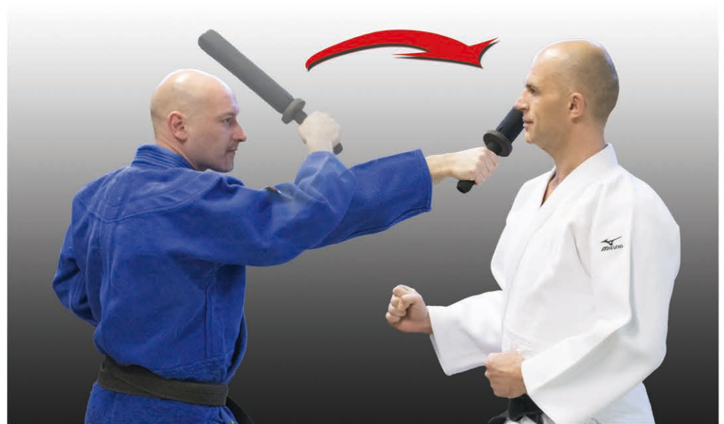
Stroke with a stick from inside to outside