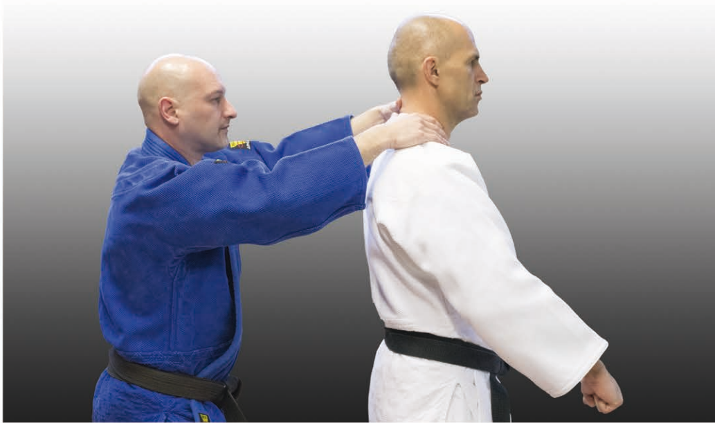
Strangulation from behind with both hands