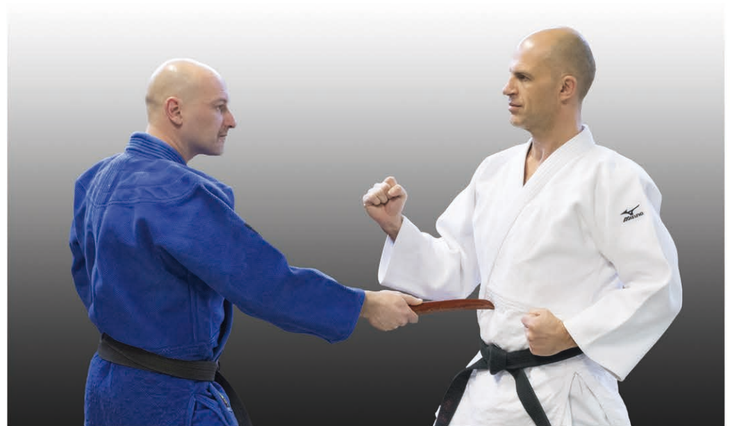
Knife stab to the stomach