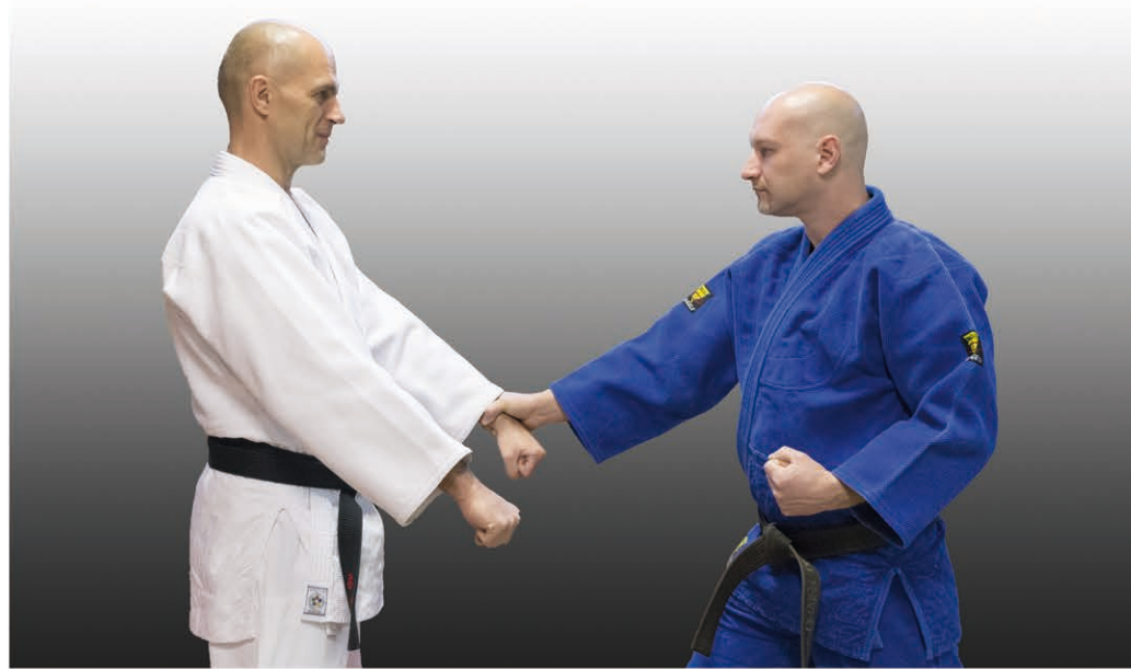
Wrist grip, same side