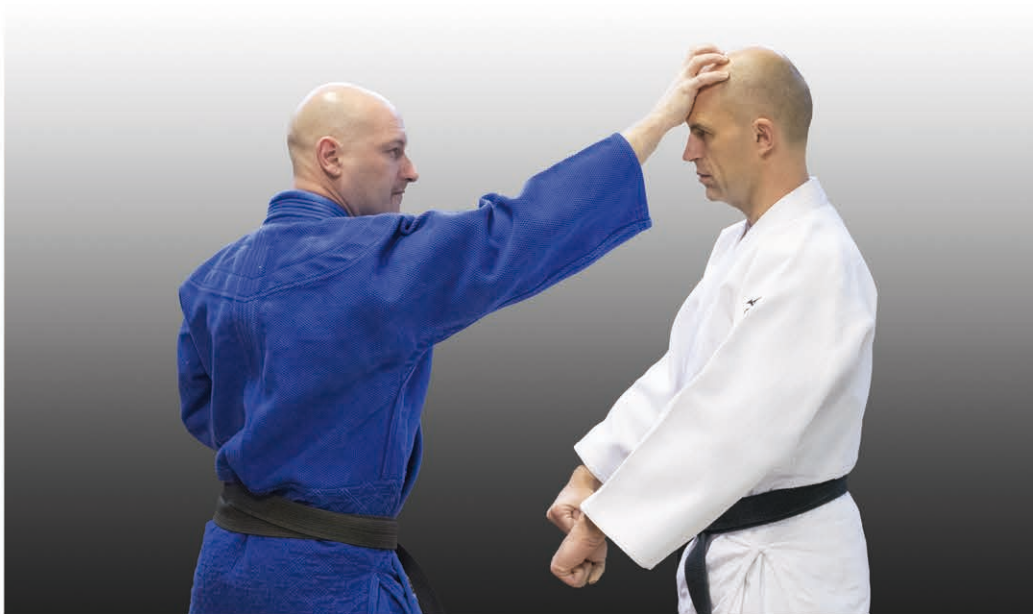
Hair grip in front