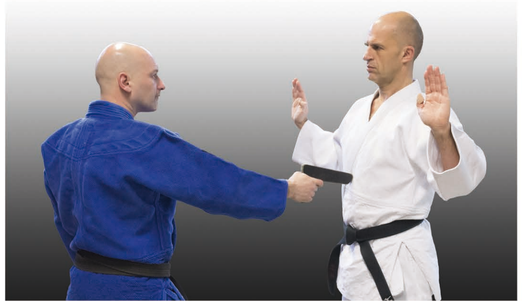
Gun in front