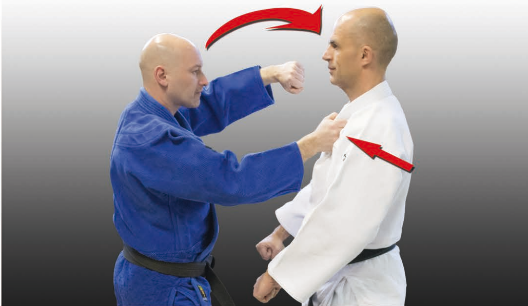
Collar grip and straight punch