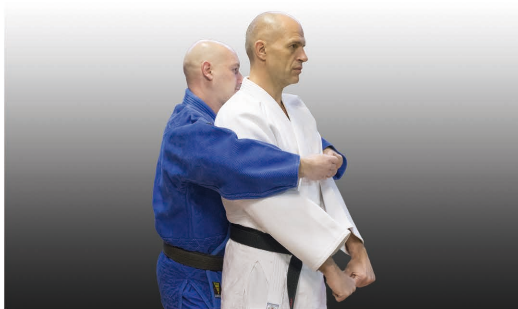
Around the arms from behind