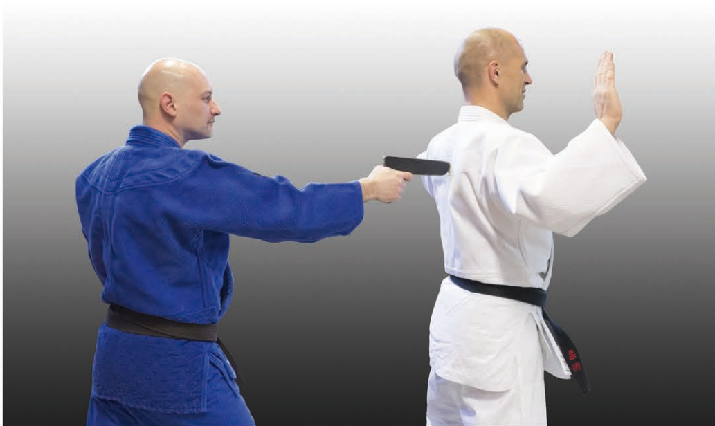
Gun from behind