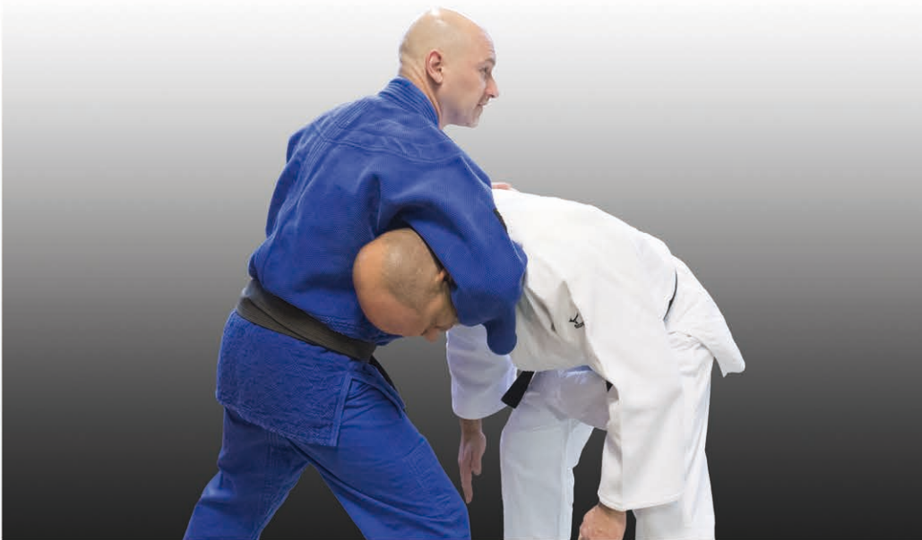
Across the head from in front