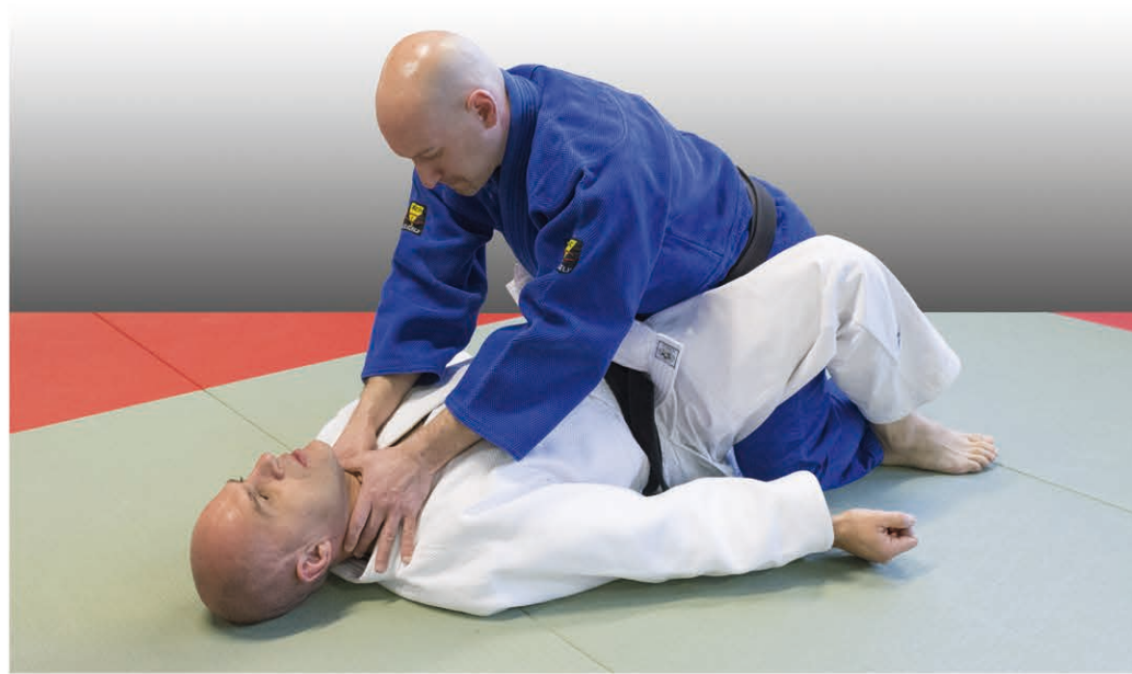
Stretched out-partner sits between the legs and strangles with both hands