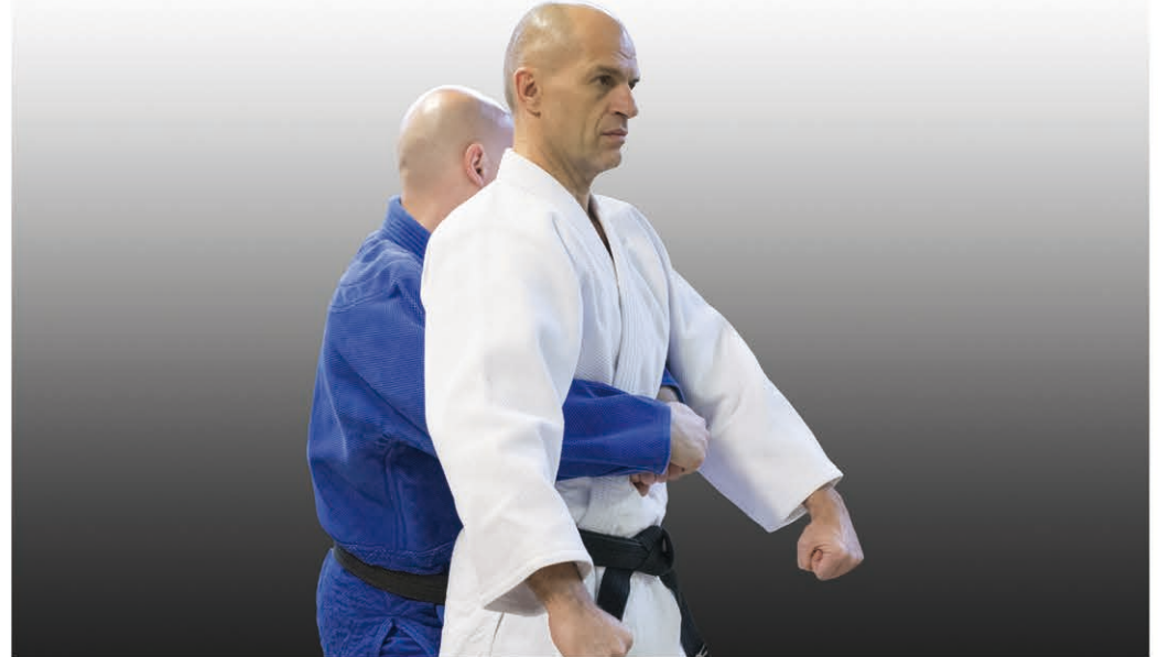
Round the hips from behind