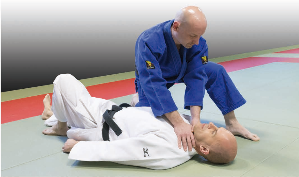
Stretched out - partner sits next to the body and strangles with both hands