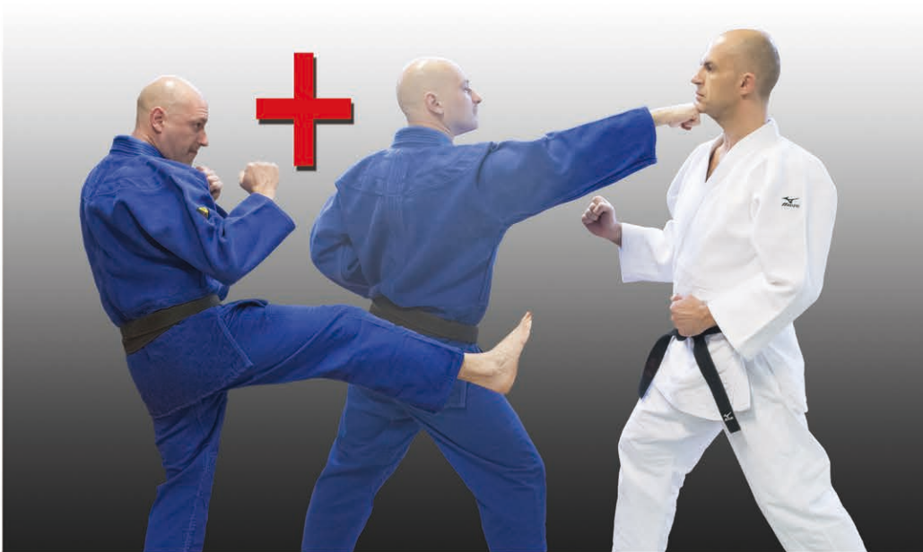
Front kick and straight punch