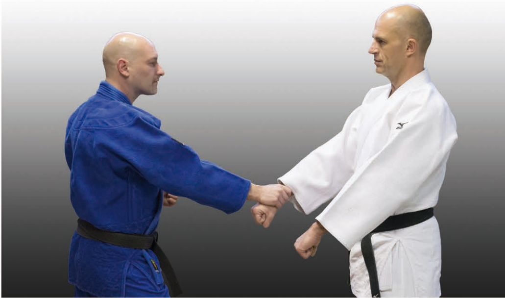
Crossed wrist grip