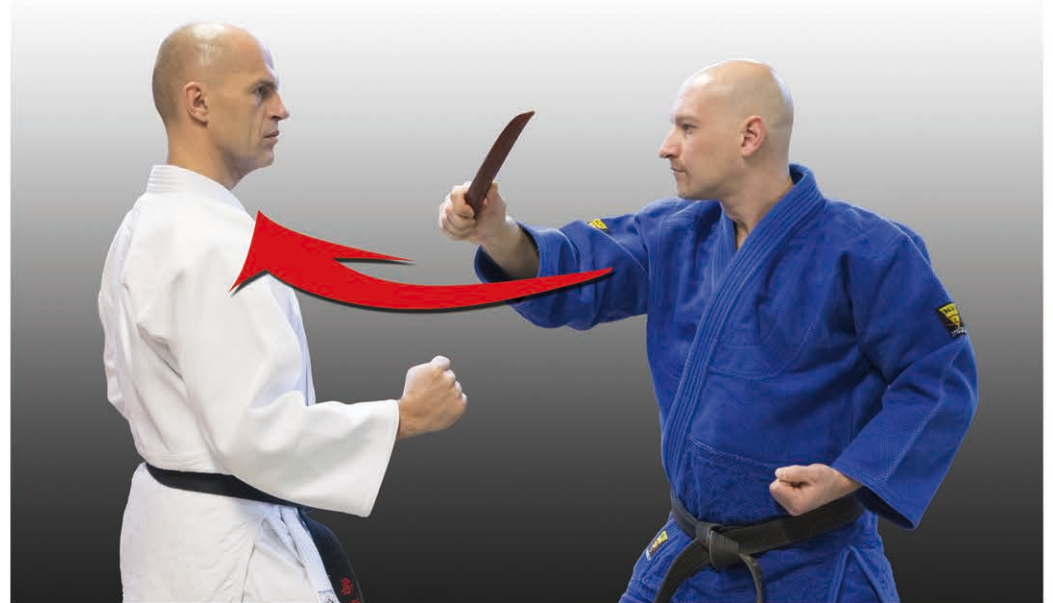
Knife cut from inside to outside