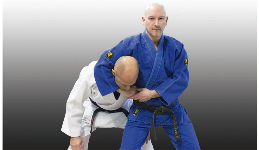
Across the head from side