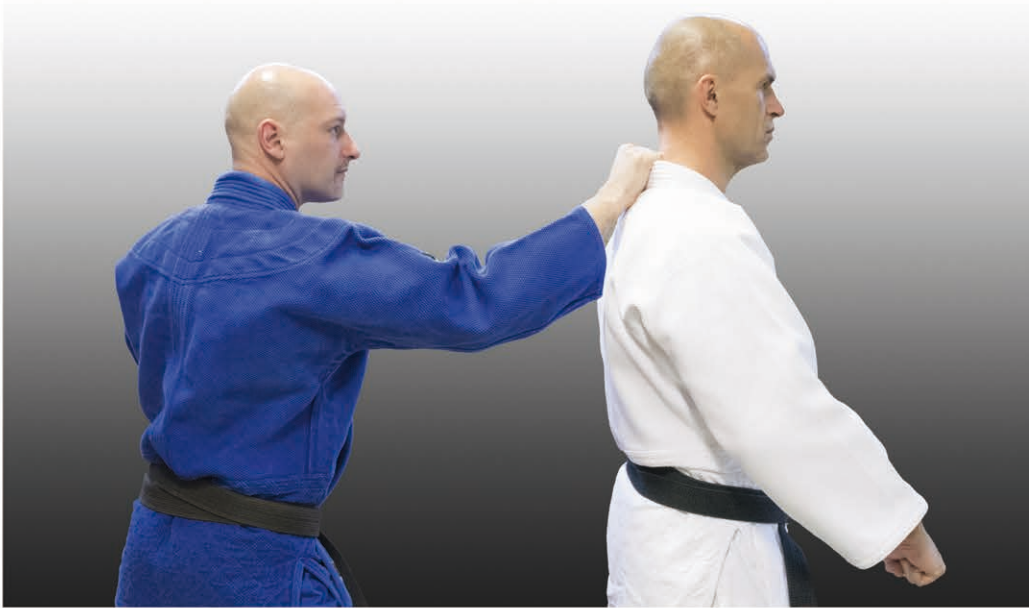
Collar grip from behind with one hand