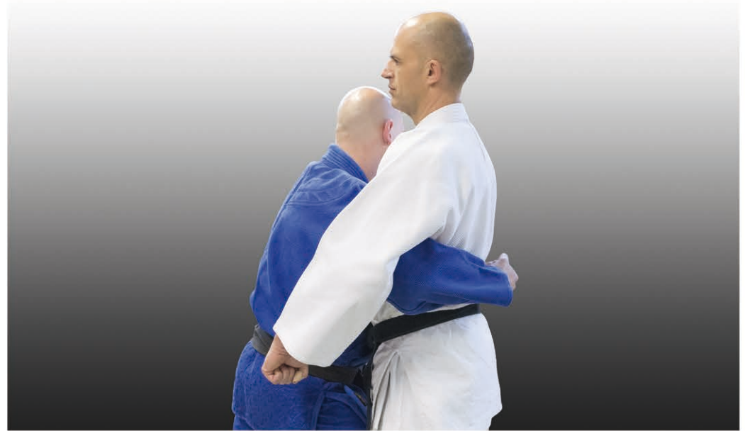
Round the hips from in front