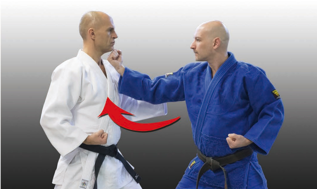
Uppercut to the chin