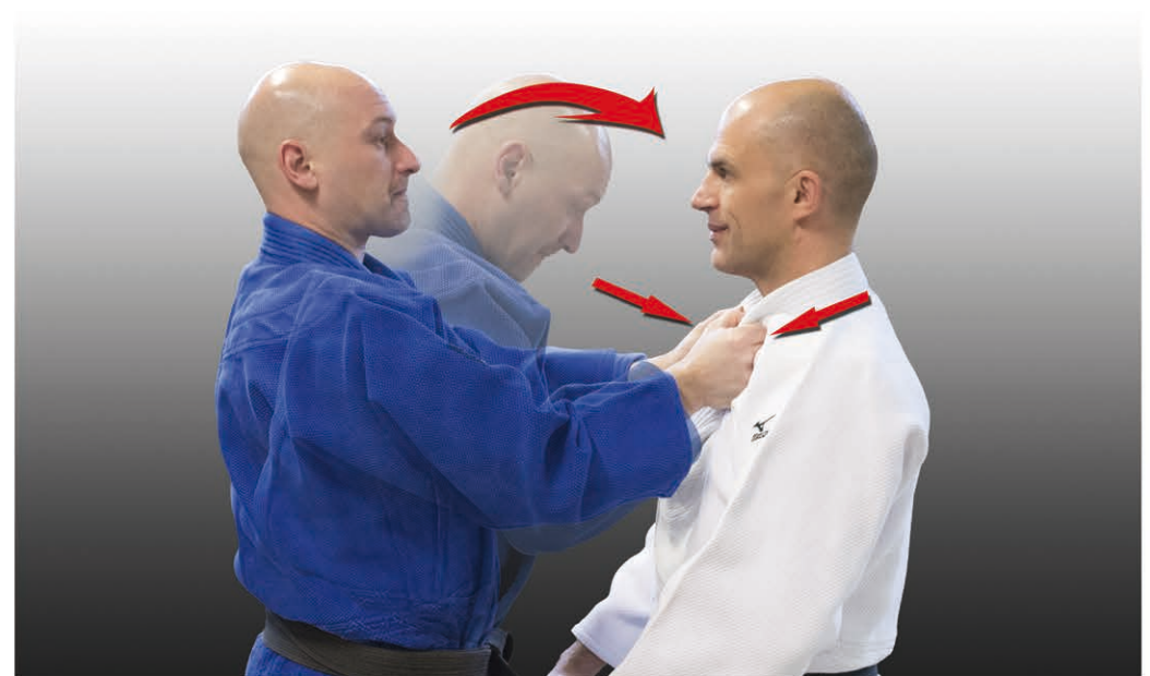
Double collar grip and head-butt