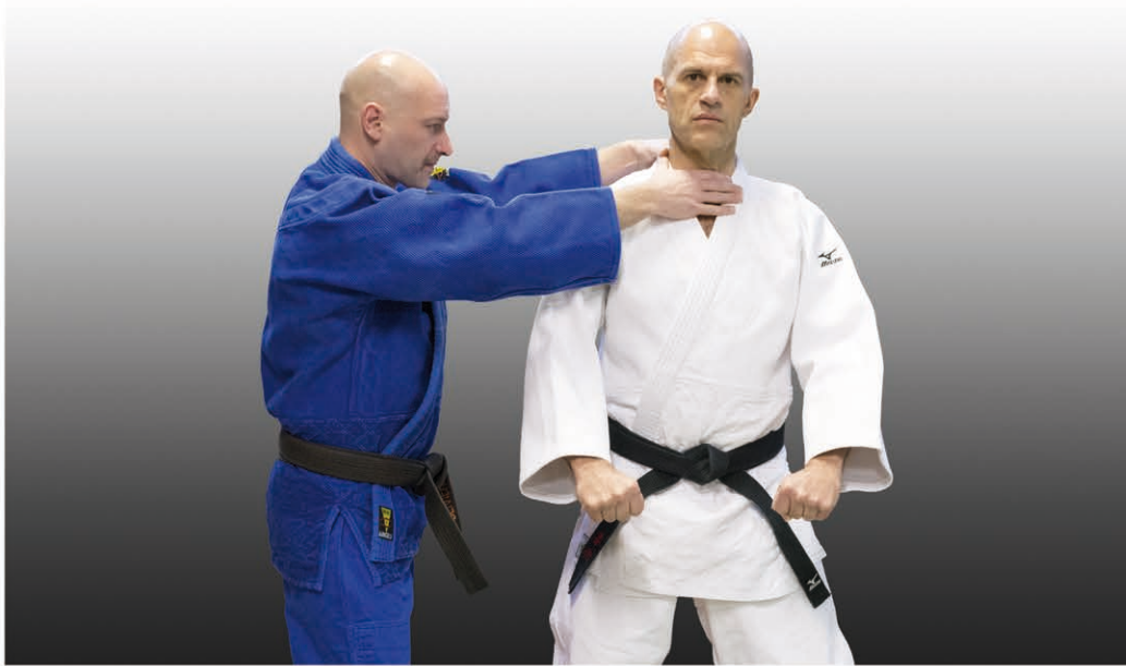
Strangulation from side with both hands