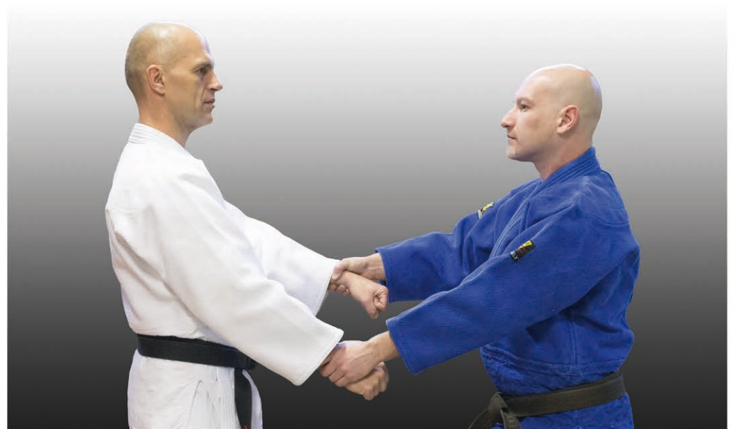
Double wrist grip from in front