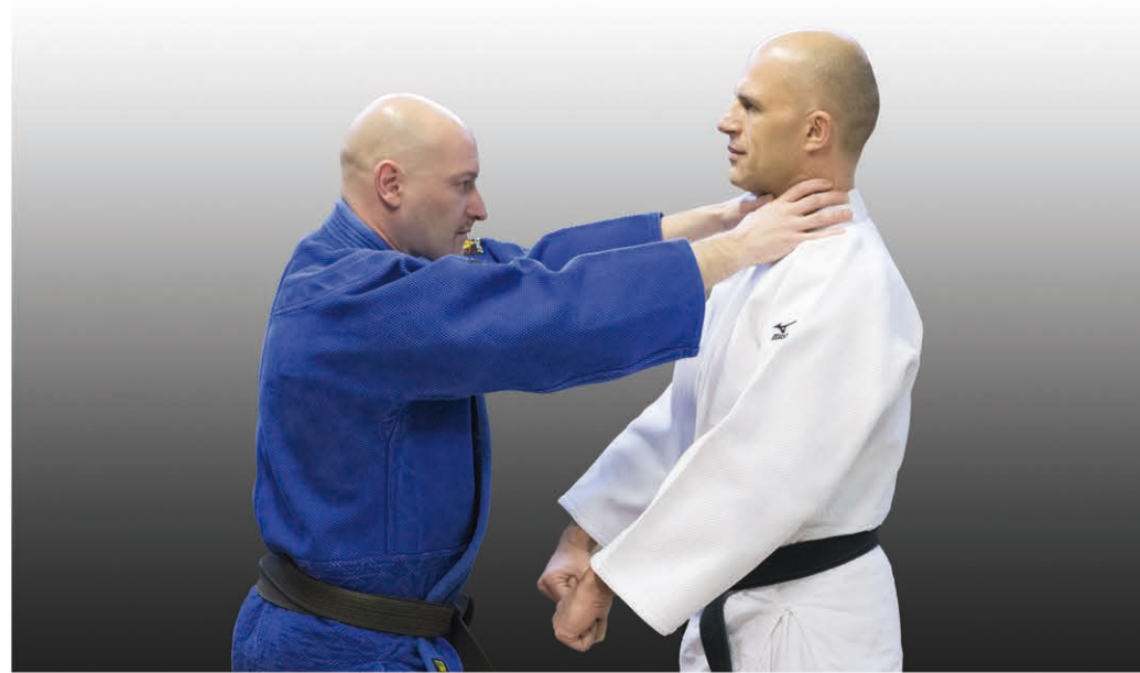
Strangulation from front with both hands