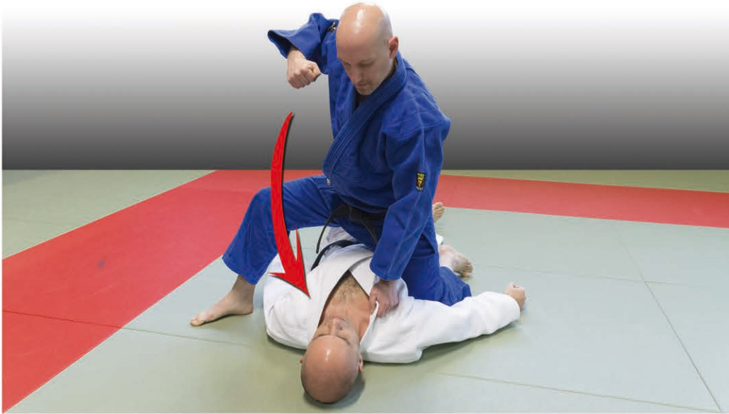
Stretched out - partner sits across the body and punches