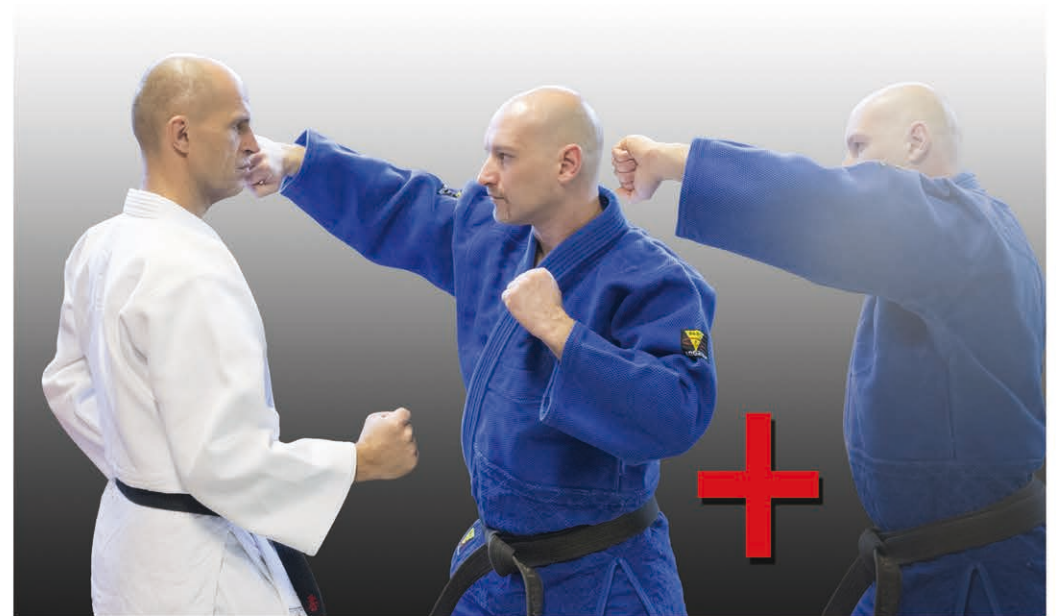
Double roundhouse punch