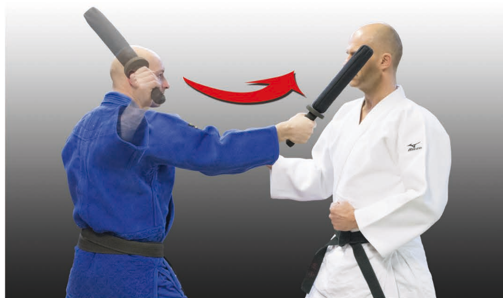
Strike with a stick from outside to inside