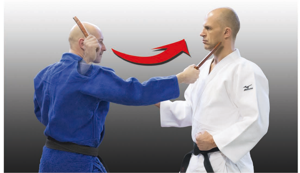
Knife cut from outside to inside