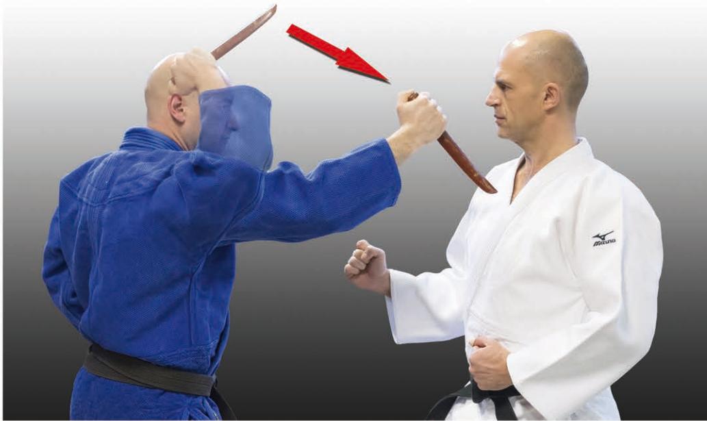
Knife cut from above