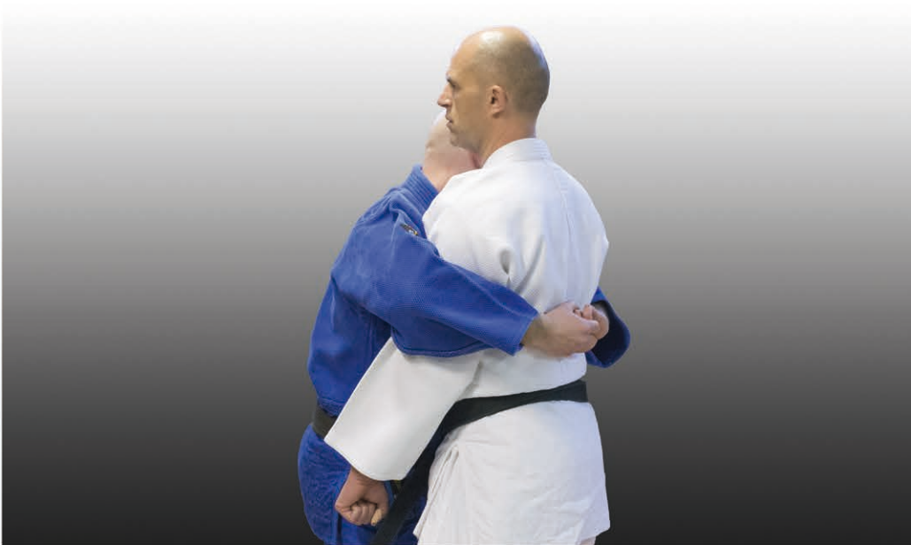
Around the arms from in front