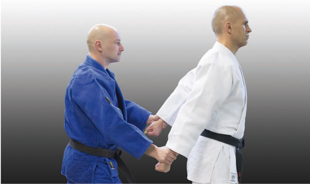
Double wrist grip from behind